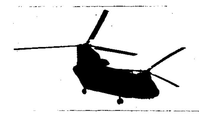
Distinctive Silhouette of CH-47 Helicopter

Second, military organizations could better serve the citizens of the